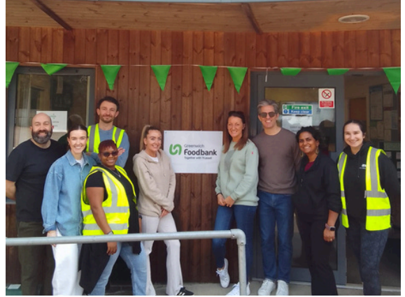
Greenwich Foodbank depot, March 2026

Volunteers from companies across Greenwich and beyond have donated over 1,000 hours to help prepare and pack food parcels. We have developed new donor relationships, too. Our Impact Days highlight the importance of cross-sector collaboration and partnership as Greenwich Foodbank moves towards advocating for longer-term, dignified solutions to food insecurity.