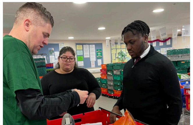
Photo: Greenwich Foodbank Impact Day with Abena Oppong-Asare MP's team, December 2025

42 'Impact Days' hosted with corporate supporters