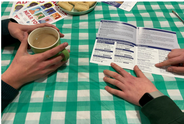
Photo: Greenwich Foodbank advice, March 2026

We provided direct support to over 3,227 families and 6,899 children, offering food support to help them during crisis and difficulty.