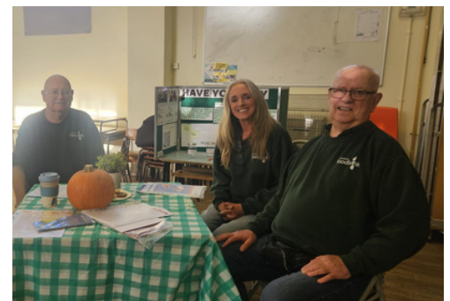
Photo: Kidbrooke team, Greenwich Foodbank, 2025

"Hearing personal stories about what brought people to (Greenwich) Foodbank really puts life into perspective. I'm grateful that I have met lovely people and I'm glad to give back to my local community"