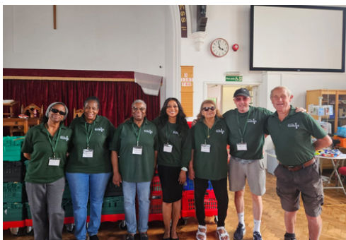
Photo: Plumstead team, Greenwich Foodbank, 2025