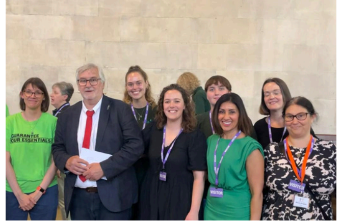
Photo: Greenwich Foodbank, Clive Efford MP and partners at Westminster, June 2025

145 lived experienced insights collected and shared